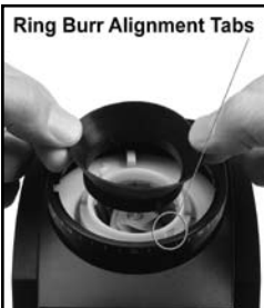
Ring Burr Alignment Tabs

Replace the ring burr by lining up the red tab on the ring burr with the red arrow on the adjustment ring, if it is not aligned rotate the adjustment ring fully counter clockwise. Wiggle and push down firmly on the ring burr to ensure that it seats properly.