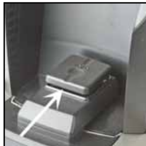
The narrow gap under the weighing platform MUST be free of ground coffee.

If the weight display does not count up properly when grinding coffee, remove the grounds bin and blow air under the weighing platform to clear any coffee grounds from the narrow gap under the platform. DO NOT use any type of tool under the weighing platform.